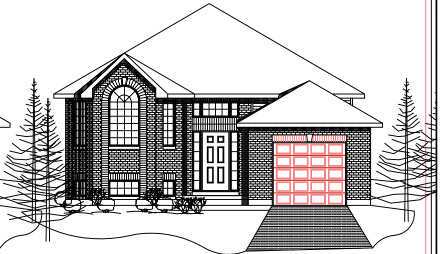
front elevation B