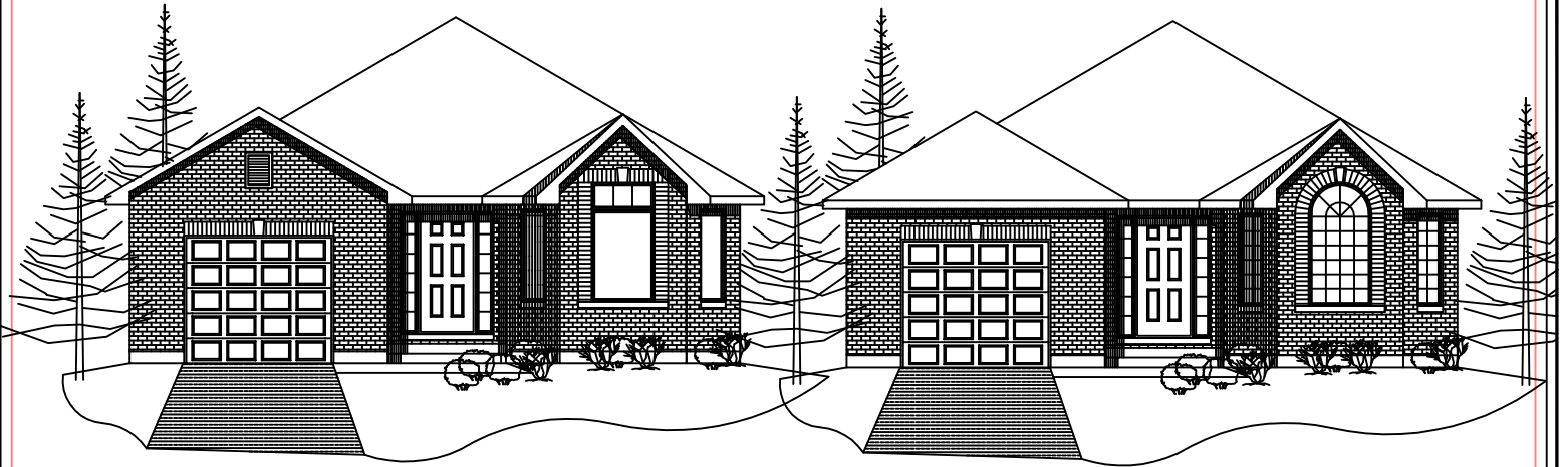
front elevation A